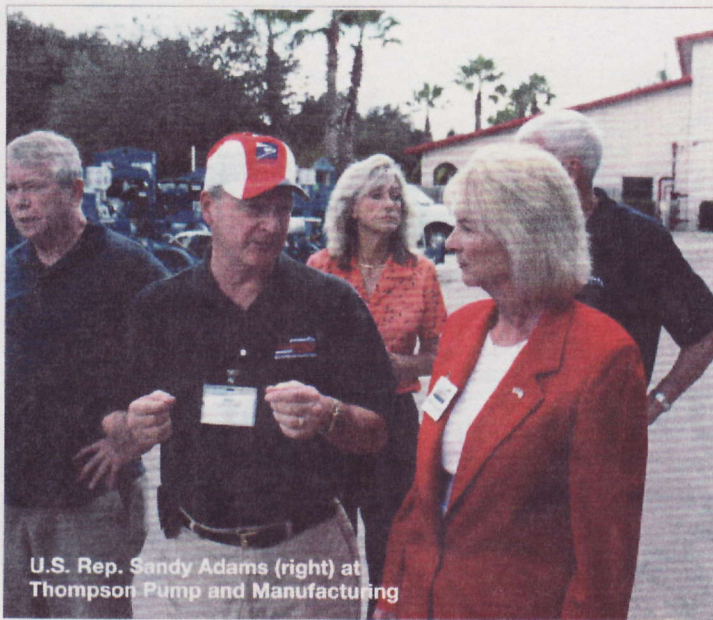
U.S. Rep. Sandy Adams (right) at Thompson Pump and Manufacturing