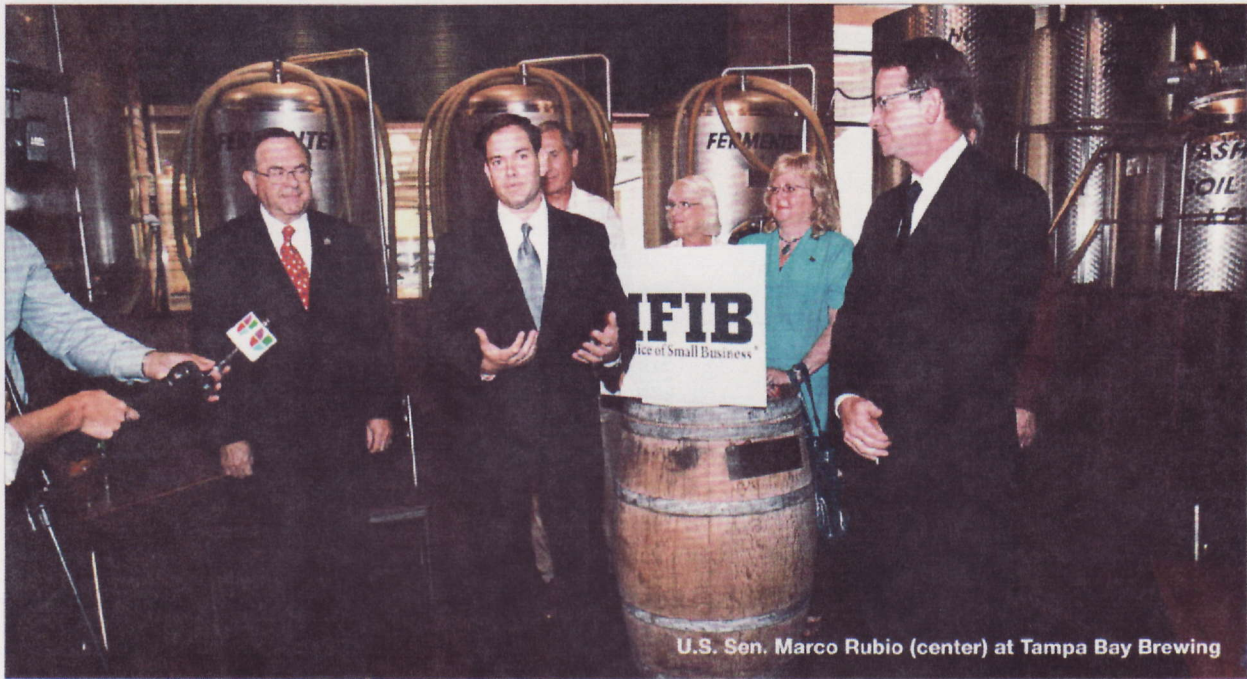
U.S. Sen. Marco Rubio (center) at Tampa Bay Brewing